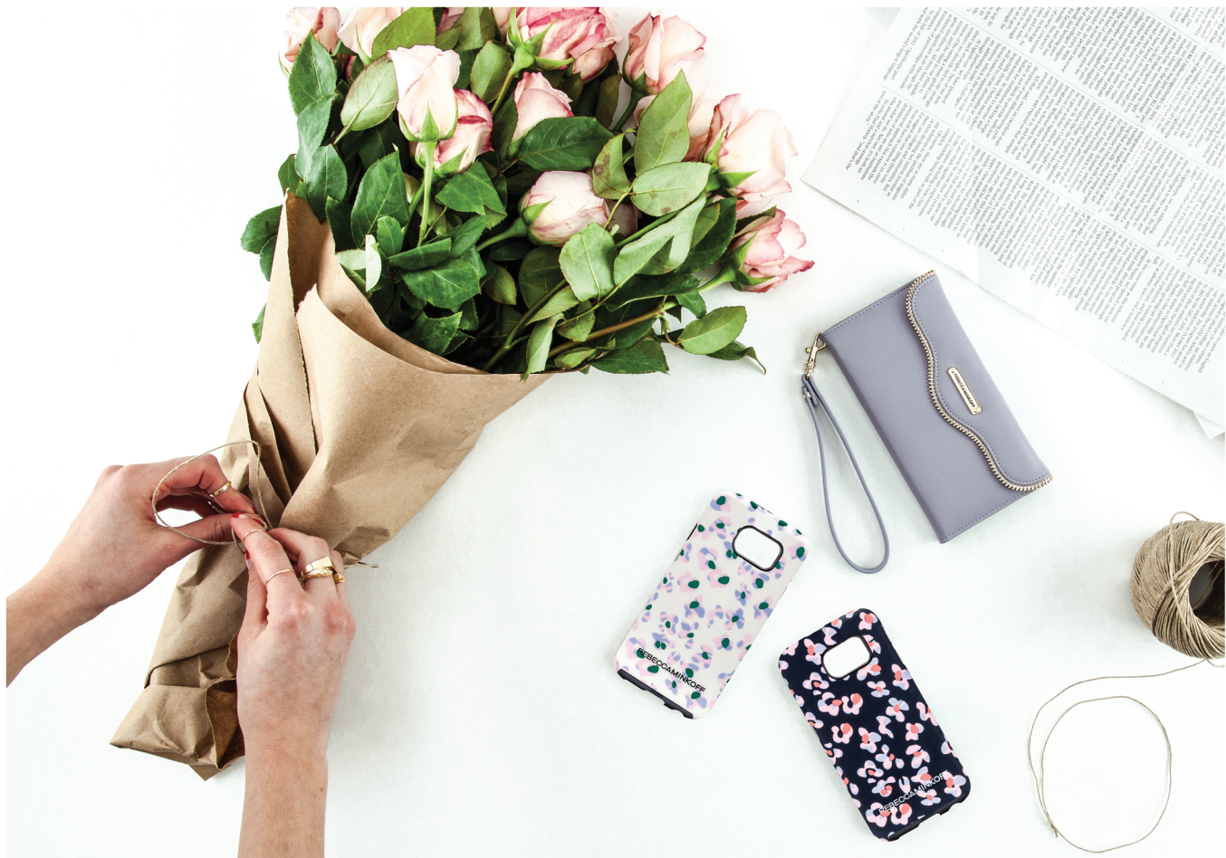
Rebecca Minkoff phone cases shown above